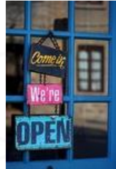
Come In, We're Open gary simmons cc-by-nc-sa flickr