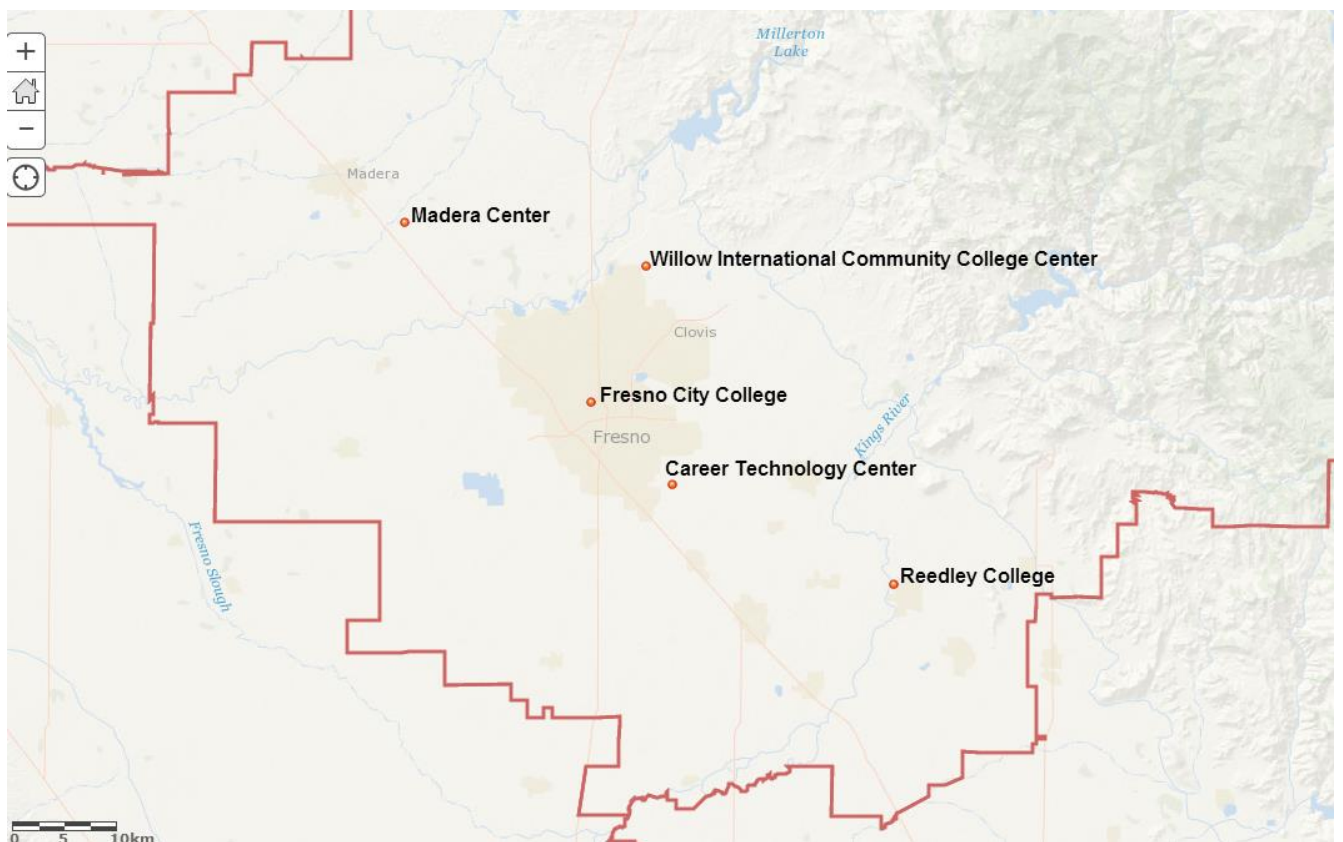
Figure 1: State Center Community College District – State Approved District Locations