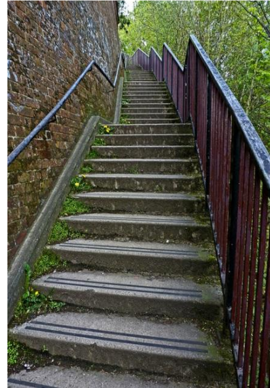
"Steps, Canal Road, Armley" by Tim Green is licensed under CC BY 2.0